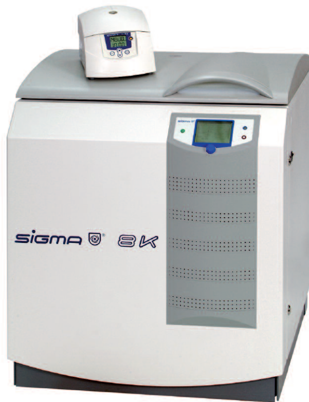
Delivery without micro centrifuge