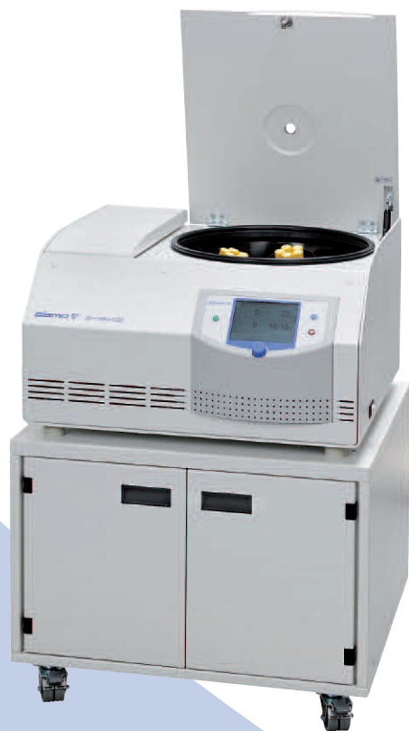
17926 Trolley (W x H x D, 670 x 497 x 650 mm)