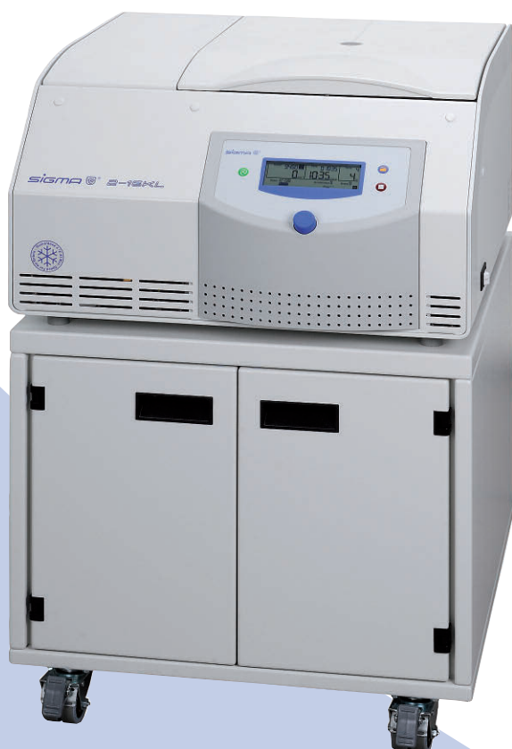
17920 Trolley for Sigma 2-16KL (w x d x h) (570 x 497 x 600 mm)